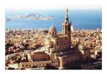
Notre Dame de la Garde, Marseille